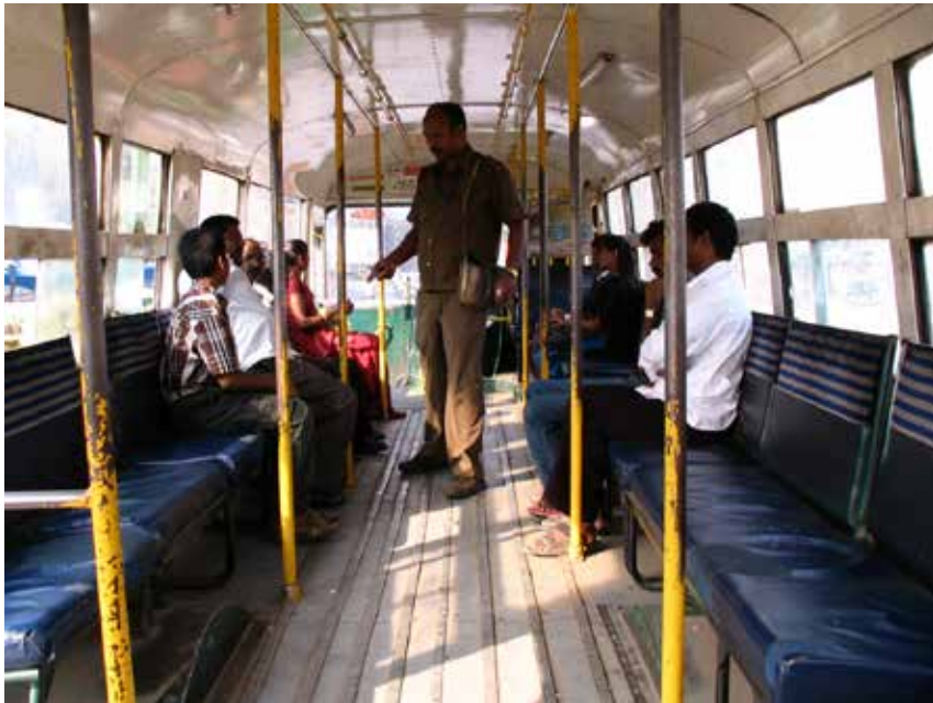
Figure 1: Atalsarige bus interior

rate and the provisional figures of Census of India 2011 indicate that about 30-40 per cent of the population in Bangalore are slum dwellers, as compared to 23 per cent in 2001 [4]. According to a Government of Karnataka report on urban development in Karnataka, the monthly per capita expenditure of slum dwellers in Karnataka is much lower than in other comparable cities (10 th in India) [5]. The reason for this is that while the employment opportunities in the informal sector have grown in urban regions, it has not been accompanied by growth in