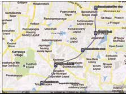
Figure 4: AS-14

spatial terms. The survey covered 1080 households in a spread of 36 slums. A part of the survey had collected information about the travel behaviour of slum dwellers. The respondents were asked to give their concerns about public transport. Table 1 summarizes the main concerns of the respondents.