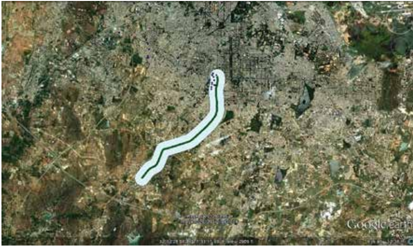
Figure 6: Map showing 400m zone around AS-14 and BBMP slums in this zone

large attractor for these people. The reason could be that the bus does not connect them to their work destinations.