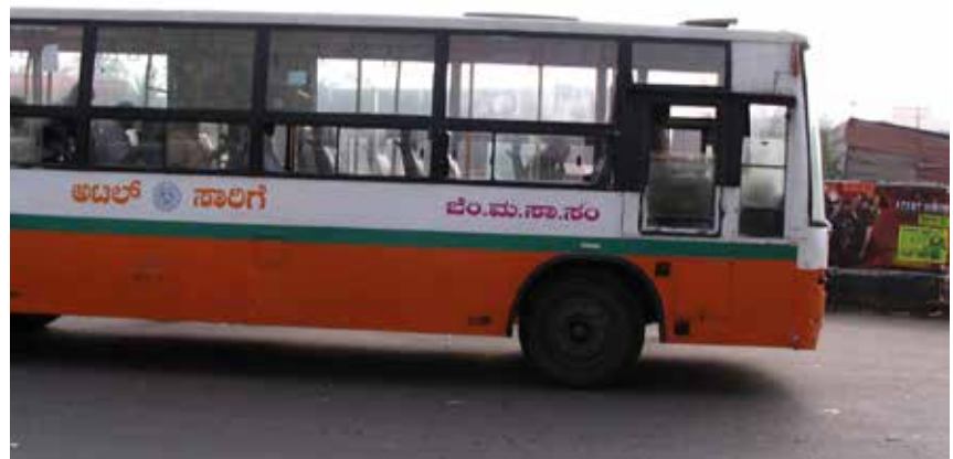
Figure 2: Uniquely branded service

According to a survey conducted by a Bangalore based think tank, CSTEP (Center for Science, Technology and Policy), 70 per cent of the slum dwellers travel for less than 30 minutes to work [6]. The two major modes of travel to work for the slum dwellers are walk and public transport (52 per cent and 33 per cent respectively) [6]. A 30 minute travel would approximately be equivalent of 8 km 1 . An 8 km. travel by Public Transport (PT) in Bangalore 2 would cost Rs 11/-. According to the CTTS, the per capita trip rate for Bangalore is 0.924 [7]. The average household size in the slums is around 5 persons [6]. Using these numbers the average total travel cost per household 3 works out to be between Rs. 1200-1500. According to a survey conducted by The Energy Research Institute (TERI), the average household income varied between Rs. 2000-4000 [8]. Another study (of slums around JC Road in Bangalore) found that 62 per cent of the households in those slums depended wholly or partially on incomes ranging from Rs 1386