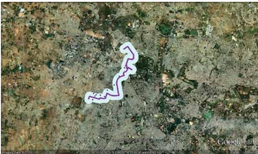
Figure 5: Map showing 400m buffer zones around AS-8 and the slums which fall within this zone

The waiting time at bus stops is the next most reported concern. Long waiting time can be caused by delay due to congestion etc. or due to insufficient number of buses on a route (scheduled waiting times are sometimes large). Improving the reliability as well of regularity of bus services can benefit the urban poor.