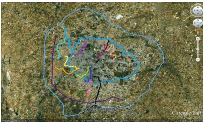
Figure 8: Map showing the Atal Sarige routes and the ring roads in Bangalore (Inner, Outer, Peripheral)